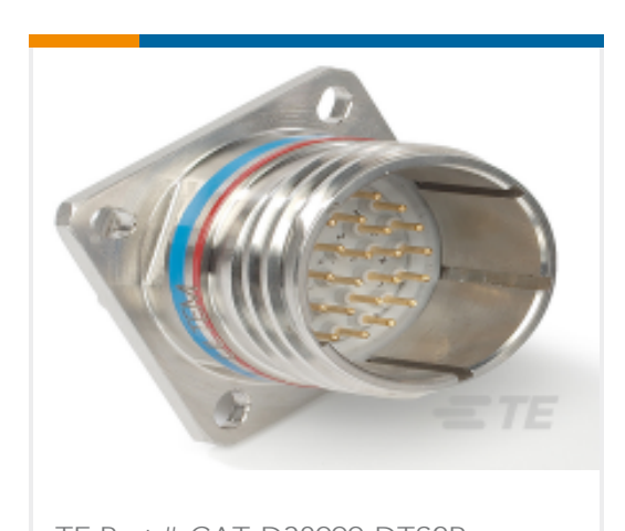
TE Part # CAT-D38999-DTS2R D38999: Square Flange, 11-98 insert