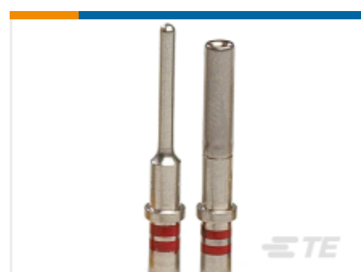
TE Part #ZPF00000000001261 097-0267-16 A1267