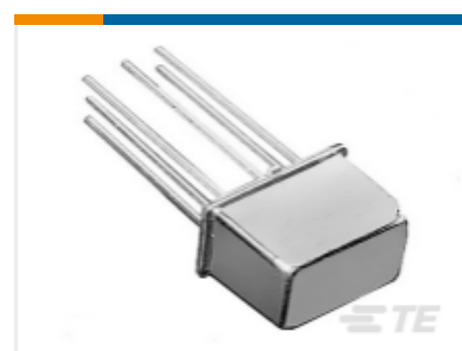
TE Part #1617147-5 JMGAP-26P = M39016/17-030P