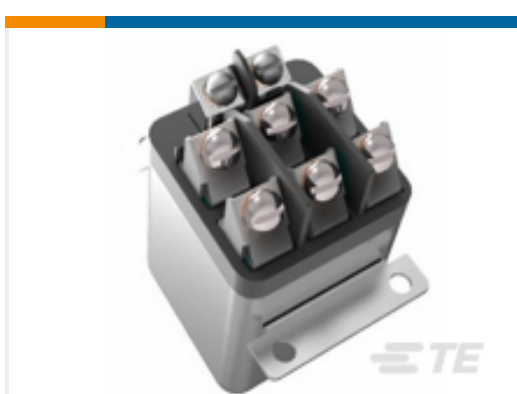
TE Part #1617807-5 FC-335-SY8= RELAY, 3PST