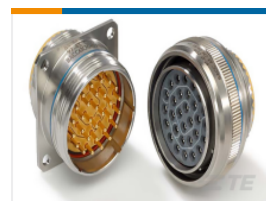
TE Part #ZPF000000000007174 983-ORS 08-98 PN