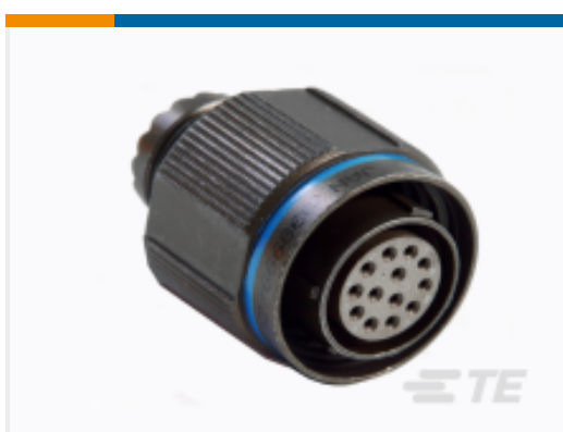
TE Part # CAT-D38999-DTS20U D38999: Straight Plug, 19-35 Insert