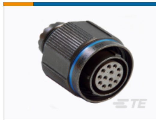
TE Part #YDTS26G17-26PAV001 PLUG ASSY