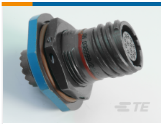
TE Part #YDTS24G09-98SNV001 RECP ASSY