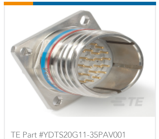
TE Part #YDTS20G11-35PAV001 D38999: Square Flange, 11-35 insert