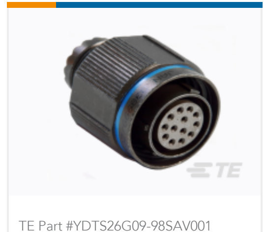
TE Part #YDTS26G09-98SAV001 Straight Plug: D38999, 09-98 Insert, Space-Grade Electroless Plating