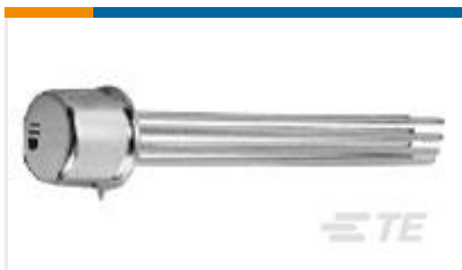
TE Part #1617119-5 J1MAW-18XP = M39016/7-021P