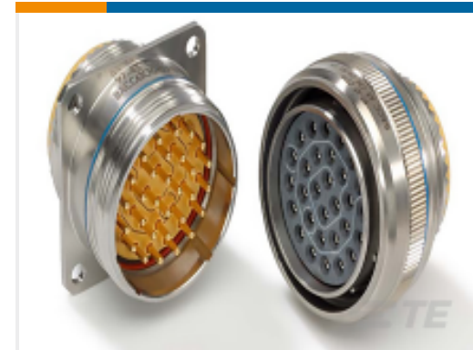
TE Part #ZPF000000000007174 983-ORS 08-98 PN