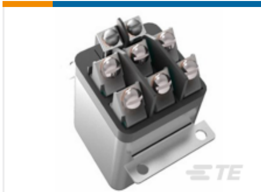
TE Part #1617807-5 FC-335-SY8= RELAY, 3PST