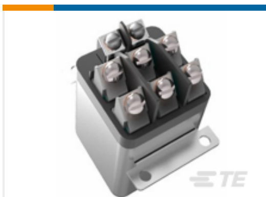
TE Part #1617807-5 FC-335-SY8= RELAY, 3PST