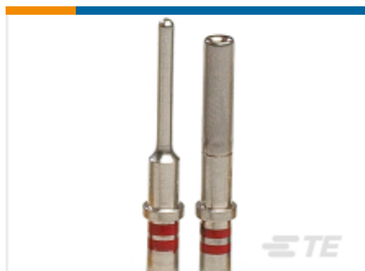
TE Part #ZPF000000000001261 097-0267-16 A1267