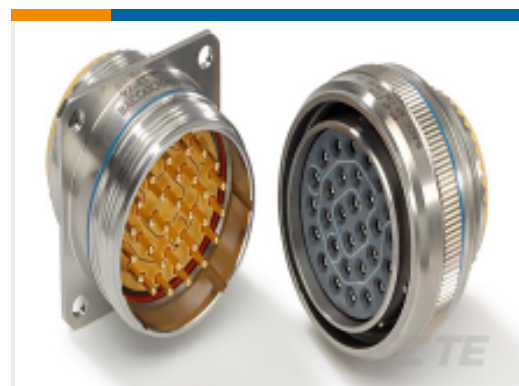
TE Part #ZPF000000000007174 983-ORS 08-98 PN