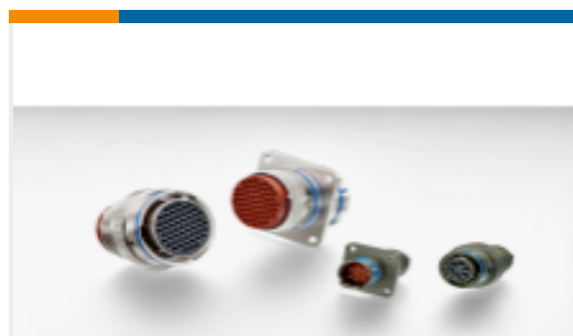
TE Part #YAFD56-14-15SWC019 PLUG ASSY