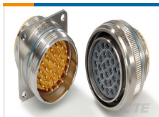
TE Part #ZPF0000000000007174 983-ORS 08-98 PN