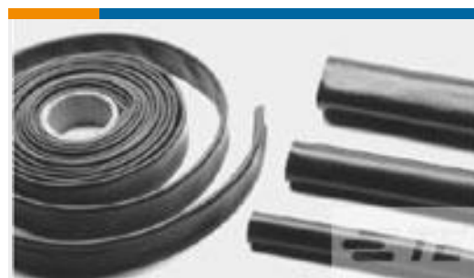
TE Part #CX1369-000 BSTS-13X4FR/NM