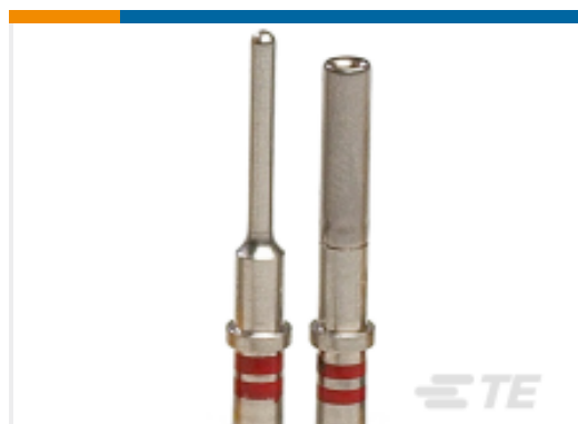
TE Part #ZPF000000000001261 097-0267-16 A1267