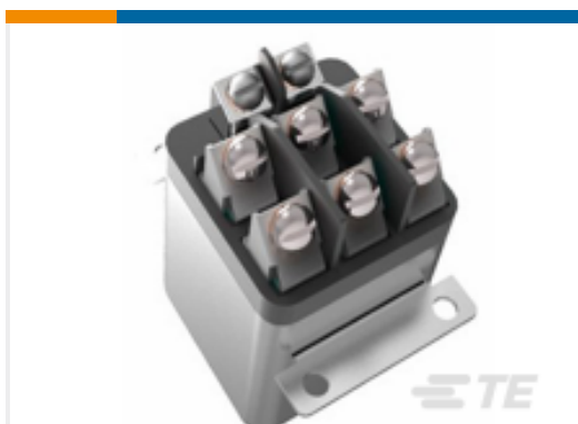
TE Part #1617807-5 FC-335-SY8= RELAY, 3PST