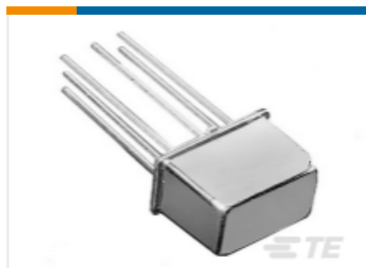
TE Part #1617147-5 JMGAP-26P = M39016/17-030P