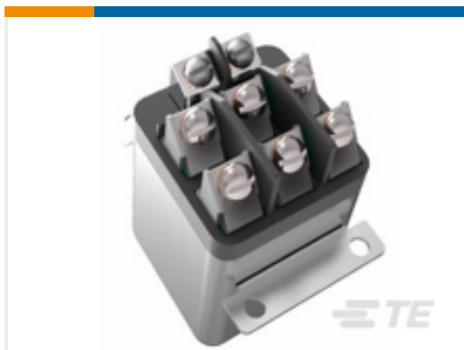
TE Part #1617807-5 FC-335-SY8= RELAY, 3PST