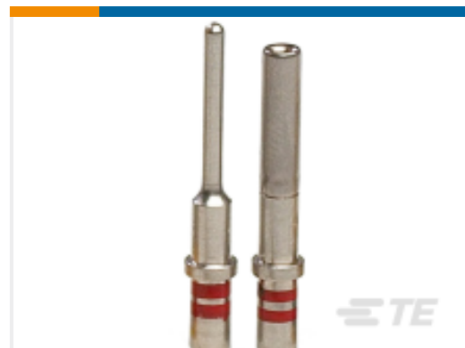
TE Part #ZPF000000000001261 097-0267-16 A1267