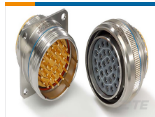
TE Part #ZPF000000000007174 983-0RS 08-98 PN