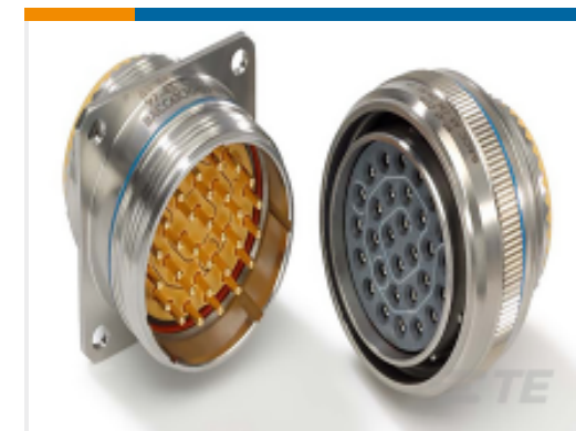
TE Part #ZPF000000000007174 983-0RS 08-98 PN