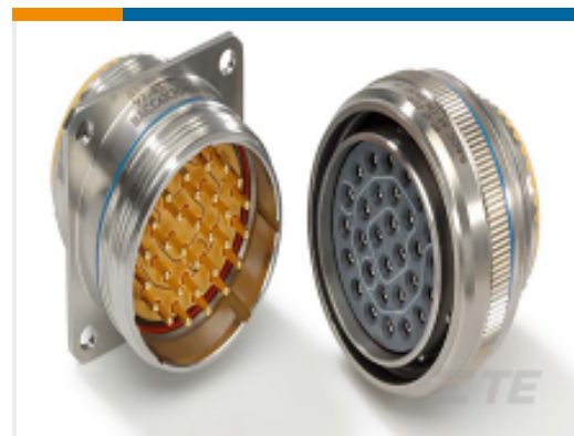
TE Part #ZPF000000000007174 983-0RS 08-98 PN