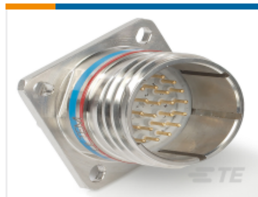
TE Part #YDTS20W19-35ANV001 RECP ASSY