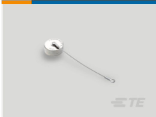
TE Part #YDTS33W11RV0010000 DUST COVER ASSEM