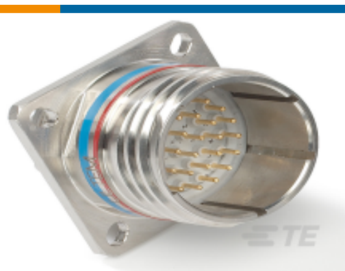
TE Part #YACT20JJ35PAV00100 SQUARE FLANGE RECEPTACLE