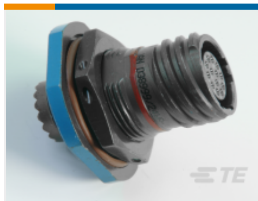
TE Part #YACT24JJ35PNV00100 JAM NUT RECEPTACLE