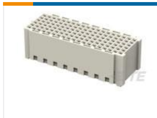
TE Part #2102061-3 Mezalok, Socket, 114 p, 12 mm, 50 Au, TL