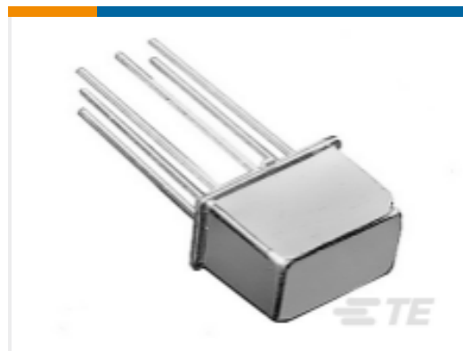
TE Part #1617147-5 JMGAP-26P = M39016/17-030P