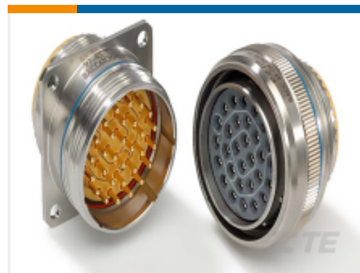
TE Part #ZPF000000000007174 983-ORS 08-98 PN