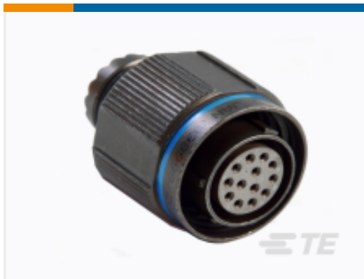
TE Part # YACT26JB05HNV00100 STRAIGHT PLUG