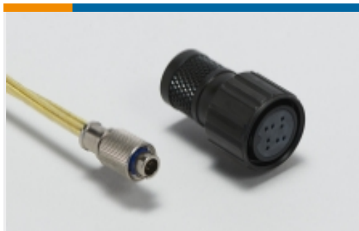
Standard Circular Connectors(19419)