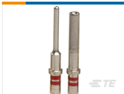
TE Part #ZPF00000000001261 097-0267-16 A1267