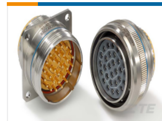
TE Part #ZPF000000000007174 983-ORS 08-98 PN