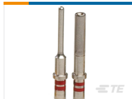
TE Part #ZPF00000000001261 097-0267-16 A1267