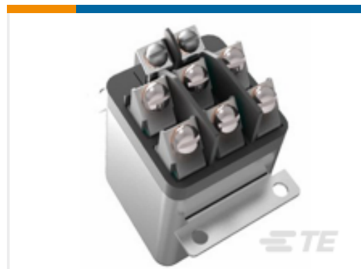
TE Part #1617807-5 FC-335-SY8= RELAY, 3PST