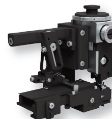
Atlantic-Style SF Mechanical