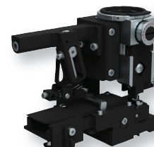
Pacific-Style SF Mechanical