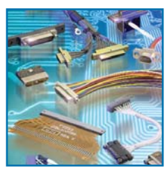
Microdot Connectors and Cables