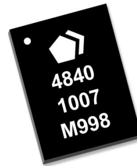
14-pin 3X4 QFN