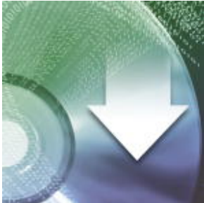
VLC SSG in a 20 pack

Please be informed that the data shown in this PDF Document is generated from our Online Catalog. Please find the complete data in the user's documentation. Our General Terms of Use for Downloads are valid ( http://phoenixcontact.com/download )