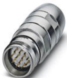
Coupling connector, straight, shielded: yes, Screw locking, M23, No. of pos.: 17, type of contact: Pin, Solder connection, cable diameter range: 9.5 mm ... 11.5 mm

Please be informed that the data shown in this PDF Document is generated from our Online Catalog. Please find the complete data in the user's documentation. Our General Terms of Use for Downloads are valid ( http://phoenixcontact.com/download )