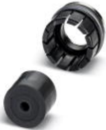
Unshielded cable clamp type cage, shielded: no, cable diameter range: 2 mm ... 10.5 mm

Please be informed that the data shown in this PDF Document is generated from our Online Catalog. Please find the complete data in the user's documentation. Our General Terms of Use for Downloads are valid ( http://phoenixcontact.com/download )