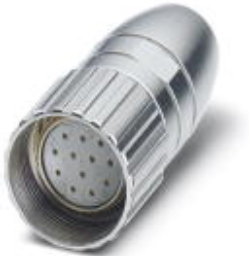
The figure shows the 12-pos. product version

Please be informed that the data shown in this PDF Document is generated from our Online Catalog. Please find the complete data in the user's documentation. Our General Terms of Use for Downloads are valid ( http://phoenixcontact.com/download )