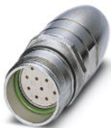
Coupling connector, straight, shielded: yes, Screw locking, M23, No. of pos.: 12, type of contact: Socket, Solder connection

Please be informed that the data shown in this PDF Document is generated from our Online Catalog. Please find the complete data in the user's documentation. Our General Terms of Use for Downloads are valid ( http://phoenixcontact.com/download )