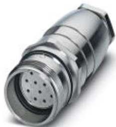
Coupler connector, with Pg13.5 connection thread, straight, shielded: no, Screw locking, M23, No. of pos.: 12, type of contact: Socket, Solder connection

Please be informed that the data shown in this PDF Document is generated from our Online Catalog. Please find the complete data in the user's documentation. Our General Terms of Use for Downloads are valid ( http://phoenixcontact.com/download )