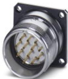
Device connector for rear wall, straight, Screw locking, M23, No. of pos.: 8+1, type of contact: Pin, Solder connection, Flat gasket, 4x M2.5

Please be informed that the data shown in this PDF Document is generated from our Online Catalog. Please find the complete data in the user's documentation. Our General Terms of Use for Downloads are valid ( http://phoenixcontact.com/download )