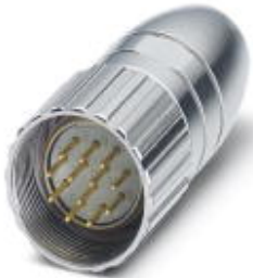
The figure shows the 12-pos. product version

Please be informed that the data shown in this PDF Document is generated from our Online Catalog. Please find the complete data in the user's documentation. Our General Terms of Use for Downloads are valid ( http://phoenixcontact.com/download )