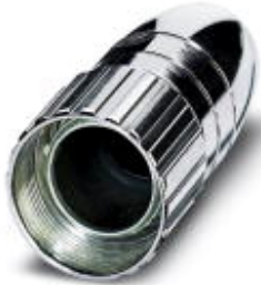
Cable connector, straight, shielded: yes, Screw locking, M23, cable diameter range: 3 mm ... 10.5 mm

Please be informed that the data shown in this PDF Document is generated from our Online Catalog. Please find the complete data in the user's documentation. Our General Terms of Use for Downloads are valid ( http://phoenixcontact.com/download )