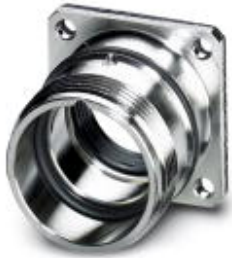
Panel mounting base, straight, Screw locking, M23, Flat gasket, 4x Ø 3.2, shielded: yes

Please be informed that the data shown in this PDF Document is generated from our Online Catalog. Please find the complete data in the user's documentation. Our General Terms of Use for Downloads are valid ( http://phoenixcontact.com/download )