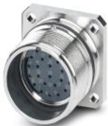
Device connector, front mounting

Please be informed that the data shown in this PDF Document is generated from our Online Catalog. Please find the complete data in the user's documentation. Our General Terms of Use for Downloads are valid ( http://phoenixcontact.com/download )