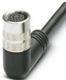
Master cable, 14-position, PUR/PVC, deep black RAL 9005, free cable end, on Socket angled M16, cable length: 15 m

Please be informed that the data shown in this PDF Document is generated from our Online Catalog. Please find the complete data in the user's documentation. Our General Terms of Use for Downloads are valid ( http://phoenixcontact.com/download )