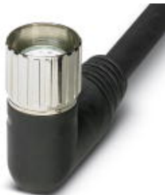
Socket M23, 19-pos., angled, shielded, with shielded, connected master cable, length: 5 m

Please be informed that the data shown in this PDF Document is generated from our Online Catalog. Please find the complete data in the user's documentation. Our General Terms of Use for Downloads are valid ( http://phoenixcontact.com/download )