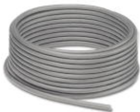
Cable ring, PUR/PVC gray, 3-pos., conductor colors: brown/blue/black, cable length: 100 m

Please be informed that the data shown in this PDF Document is generated from our Online Catalog. Please find the complete data in the user's documentation. Our General Terms of Use for Downloads are valid ( http://phoenixcontact.com/download )