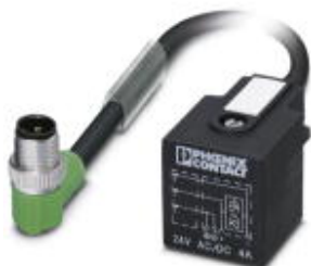
Sensor/actuator cable, 3-position, PUR, black RAL 9005, Plug angled M12, on Valve connector A, with 1 LED

Please be informed that the data shown in this PDF Document is generated from our Online Catalog. Please find the complete data in the user's documentation. Our General Terms of Use for Downloads are valid ( http://phoenixcontact.com/download )