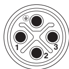
Connector pin assignment of M12 plug, 4-pos., S-coded, view of pin side