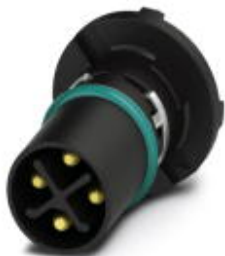
Sample set, Universal, 4-position, Plug, straight, S power, PCB mounting, THR solder connection

Please be informed that the data shown in this PDF Document is generated from our Online Catalog. Please find the complete data in the user's documentation. Our General Terms of Use for Downloads are valid ( http://phoenixcontact.com/download )