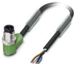
Sensor/actuator cable, 4-position, PUR halogen-free, black-gray RAL 7021, Plug angled M12, D-coded, on free cable end, cable length: 3 m

Please be informed that the data shown in this PDF Document is generated from our Online Catalog. Please find the complete data in the user's documentation. Our General Terms of Use for Downloads are valid ( http://phoenixcontact.com/download )