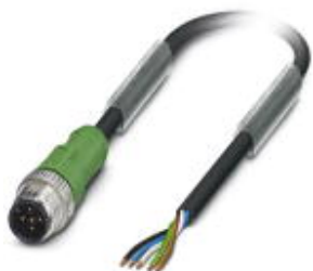
Sensor/actuator cable, 5-position, PUR halogen-free, black-gray RAL 7021, Plug straight M12, A-coded, on free cable end, cable length: 2 m

Please be informed that the data shown in this PDF Document is generated from our Online Catalog. Please find the complete data in the user's documentation. Our General Terms of Use for Downloads are valid ( http://phoenixcontact.com/download )