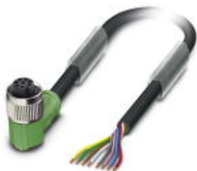
Sensor/actuator cable, 8-position, PUR halogen-free, black-gray RAL 7021, free cable end, on Socket angled M12 SPEEDCON, A-coded, cable length: 5 m

Please be informed that the data shown in this PDF Document is generated from our Online Catalog. Please find the complete data in the user's documentation. Our General Terms of Use for Downloads are valid ( http://phoenixcontact.com/download )