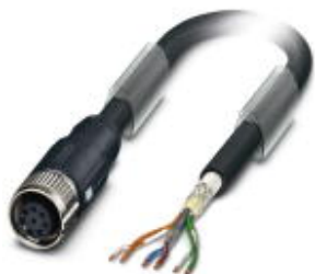
Bus system cable, VARAN, 6-position, PVC, black, shielded, cable length: 5 m, Customer version

Please be informed that the data shown in this PDF Document is generated from our Online Catalog. Please find the complete data in the user's documentation. Our General Terms of Use for Downloads are valid ( http://phoenixcontact.com/download )