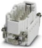
HEAVYCON male insert, B10 series, 10-pos., push-in connection

Contact insert - HC-B 10-I-DT-M - 1648199