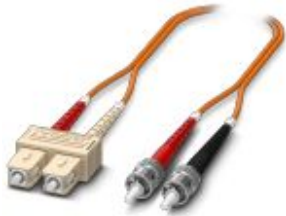
Multi-mode OM2 duplex jumper, ST-SC, UPC polishing, length 0.5 m

Please be informed that the data shown in this PDF Document is generated from our Online Catalog. Please find the complete data in the user's documentation. Our General Terms of Use for Downloads are valid ( http://phoenixcontact.com/download )