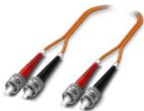
Multi-mode OM1 duplex jumper, ST-ST, UPC polishing, length 3.0 m

Please be informed that the data shown in this PDF Document is generated from our Online Catalog. Please find the complete data in the user's documentation. Our General Terms of Use for Downloads are valid ( http://phoenixcontact.com/download )