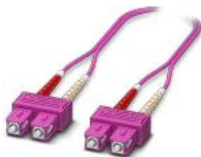
Multi-mode OM4 duplex jumper, SC-SC, UPC polishing, length 2 m

Please be informed that the data shown in this PDF Document is generated from our Online Catalog. Please find the complete data in the user's documentation. Our General Terms of Use for Downloads are valid ( http://phoenixcontact.com/download )