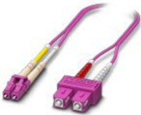
Multi-mode OM4 duplex jumper, LC-SC, UPC polishing, length 1 m

Please be informed that the data shown in this PDF Document is generated from our Online Catalog. Please find the complete data in the user's documentation. Our General Terms of Use for Downloads are valid ( http://phoenixcontact.com/download )