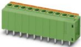
The figure shows an 10-position version

Please be informed that the data shown in this PDF Document is generated from our Online Catalog. Please find the complete data in the user's documentation. Our General Terms of Use for Downloads are valid ( http://phoenixcontact.com/download )