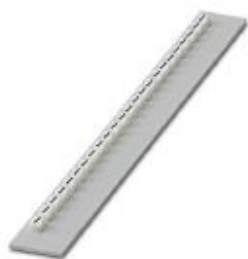
Marking material, white, pre-printed: ), mounting type: insert

Please be informed that the data shown in this PDF Document is generated from our Online Catalog. Please find the complete data in the user's documentation. Our General Terms of Use for Downloads are valid ( http://phoenixcontact.com/download )