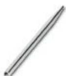
Alignment tool for cable markers, Bare metallic, mounting type: thread on, cable diameter range: 2.5 ... 16 mm

Alignment tool for cable markers - SD-WMS 5 TOOL - 0826475