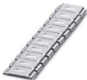
Marking collar, labeled with the capital letter: Letters, silver, width: 5.5 mm

Please be informed that the data shown in this PDF Document is generated from our Online Catalog. Please find the complete data in the user's documentation. Our General Terms of Use for Downloads are valid ( http://phoenixcontact.com/download )