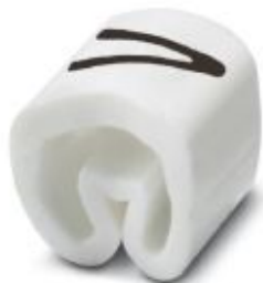
Conductor marking collar, labeled with the capital letter: Letters, white, width: 3.2 mm

Please be informed that the data shown in this PDF Document is generated from our Online Catalog. Please find the complete data in the user's documentation. Our General Terms of Use for Downloads are valid ( http://phoenixcontact.com/download )