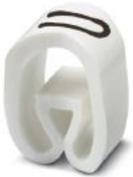
Conductor marking collar, labeled with the capital letter: Letters, lettering field size: 4.2 x 2.6 mm, white, width: 4.2 mm

Please be informed that the data shown in this PDF Document is generated from our Online Catalog. Please find the complete data in the user's documentation. Our General Terms of Use for Downloads are valid ( http://phoenixcontact.com/download )