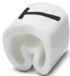
Conductor marking collar, labeled with the capital letter: Letters, white, width: 3.2 mm

Please be informed that the data shown in this PDF Document is generated from our Online Catalog. Please find the complete data in the user's documentation. Our General Terms of Use for Downloads are valid ( http://phoenixcontact.com/download )