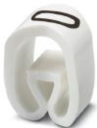
Conductor marking collar, labeled with the capital letter: Letters, lettering field size: 4.2 x 2.6 mm, white, width: 4.2 mm

Please be informed that the data shown in this PDF Document is generated from our Online Catalog. Please find the complete data in the user's documentation. Our General Terms of Use for Downloads are valid ( http://phoenixcontact.com/download )