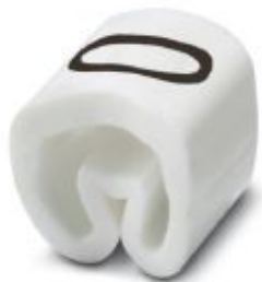
Conductor marking collar, labeled with the capital letter: Letters, white, width: 3.2 mm

Please be informed that the data shown in this PDF Document is generated from our Online Catalog. Please find the complete data in the user's documentation. Our General Terms of Use for Downloads are valid ( http://phoenixcontact.com/download )